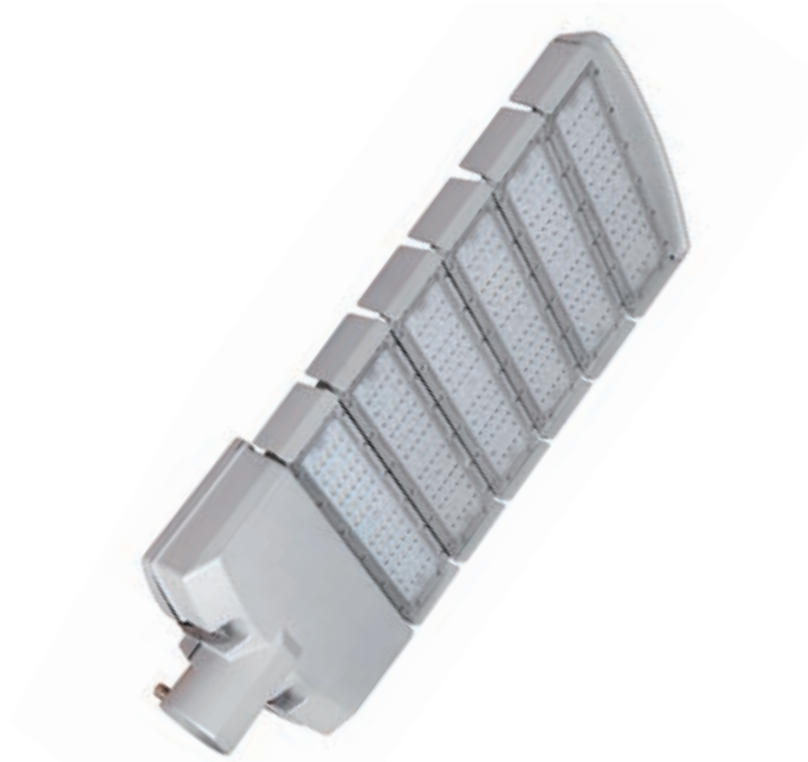
STREET 300 SMD 98STREET300SMD